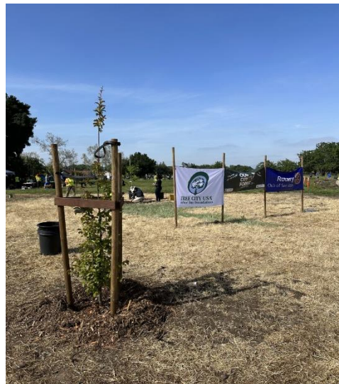
Figure 2 – Arbor Day Planting, OCF and CSJ

The City must complete an inventory of all public space street and park trees: The City last completed a street tree inventory in 2014 and does not have current information on the condition of all trees in the public space. The prior inventory provides data to inform management decisions but lacks key updated information on the health and safety condition of street trees. Funding was identified in the FY 2022-23 budget to create the inventory for City parks and this inventory will be completed in the current fiscal year. Although there is no current grant source to update the entire street-tree inventory, DOT has identified funding to initiate a partial update early in FY 2023-24 and will continue to seek grant funding or partnerships to complete a full street tree inventory. The inventory data will be used to calculate an updated cost estimate for the City to take on full maintenance responsibility and liability for all trees in the public sphere (excluding private property).